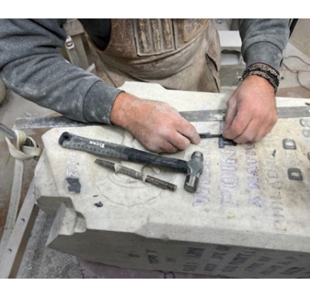
At the cemetery: the marble column is removed, the base is excavated in order to level it. In the shop: lead lettering is replaced.