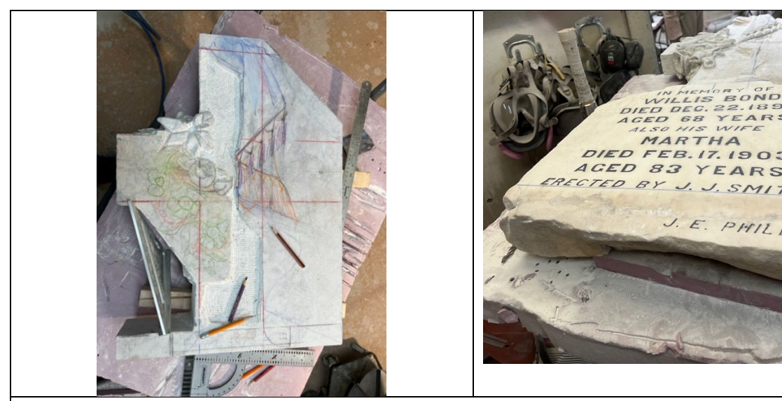
In the workshop – design and addition of the missing top, broken corner repaired